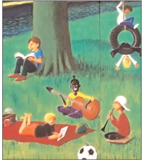
Part of a mural at Larkrise Primary School

Good Food Oxford: Good Food Oxford is a network working towards a fair, healthy, ethical and sustainable food system for Oxford and Oxfordshire. Membership is open to any individual or organisation supporting the network's aims. www.goodfoodoxford.org